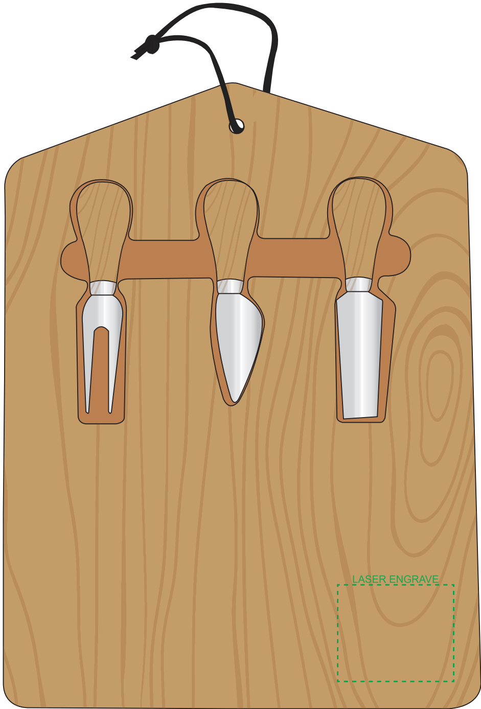
50% ACTUAL SIZE

Engraving can be moved to any position on board